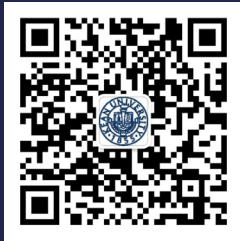
WKU Admission Office

88 Daxue Rd, Ouhai, Wenzhou, Zhejiang Province,